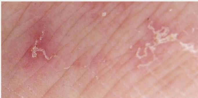
Fig. 1: Typical primary signs on mite infestation: Comma-shaped trails, generally in the form of irregular spirals, whitish and a few millimetres to 1 cm long, with a small vesicle (= mite) sometimes developing at the end.

Skin areas primarily affected are areas with higher body temperature, such as the webs between the fingers and feet, the backs of the elbows, the axillary folds, the areas around the nipples, around the waist and umbilicus, buttocks, anal folds and perianal region, groins, ankles, inner edges of the feet and, in men, the shaft of the penis (typically elongated papules).